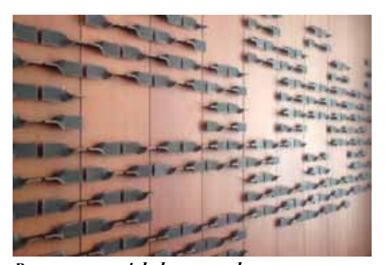
Bronze memorial plaques make up our Yahrzeit Wall.

The final result is a textural wall of twisted bronze pieces that allow for a name to be engraved on a plate, along with a place to leave a pebble to commemorate the Yahrzeit.